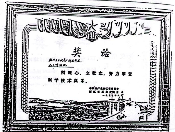
Certificate of Merit Scientific Achievements of Shaoxing Sanwu Instrument Co. Artificial Respirator For Setting a High Level Target & Making Great Effort to Climb the Peak of Science and Technology Aug. 1977 The Government of Zhejiang Province